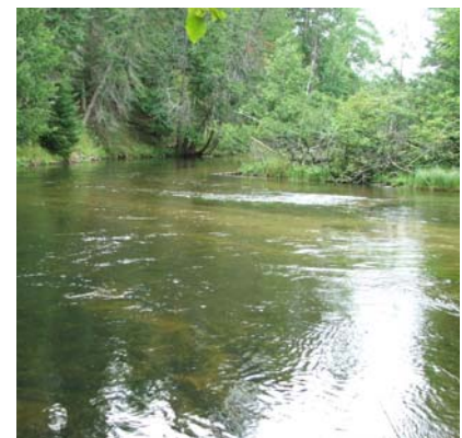
Au Sable River