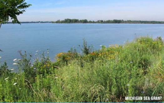
MICHIGAN SEA GRANT