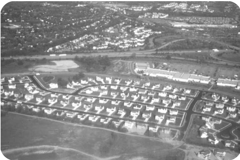
Sprawling land use patterns are the number one threat to our wetlands today.

The most effective way a community can protect wetlands and other open spaces is to plan properly for growth. Sprawling land use patterns degrade and destroy wetlands and other wildlife habitat. By targeting areas in your community for more compact development and allowing higher density neighborhoods and towns in smaller areas, your community will preserve open space and farmland in the surrounding countryside. In contrast, traditional large lot zoning spreads out development and quickly consumes large amounts of open space and wetlands.