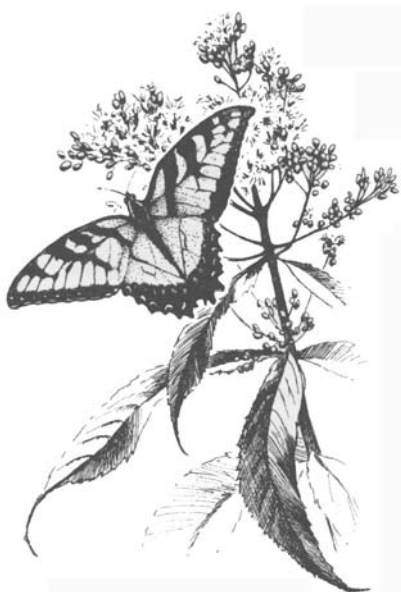
The tiger swallowtail butterfly relies on native wetland plants like the joe pye weed.

Wetland loss continues today as residential and commercial development spreads out from