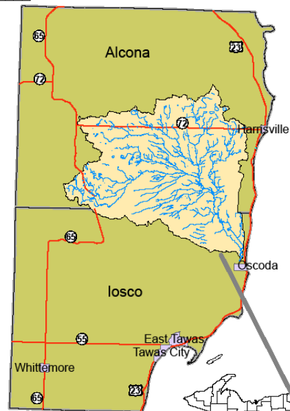
Pine River - Van Etten Lake Watershed