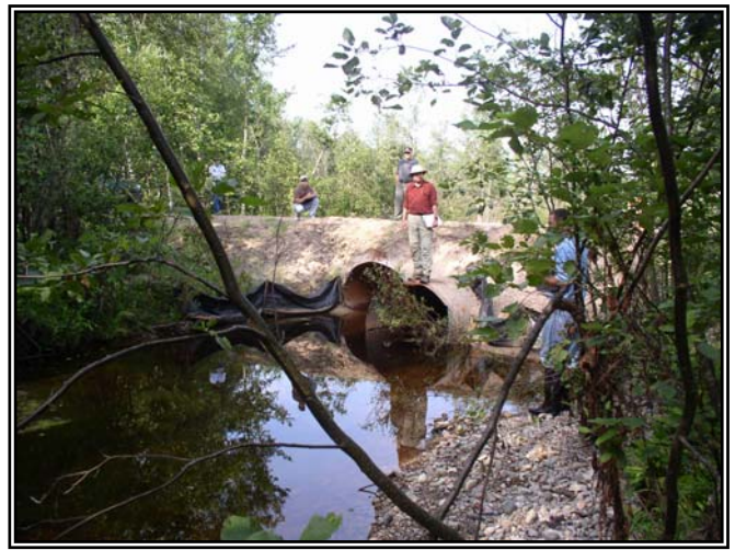
Conducting BEHI survey training on a road/stream crossing with the help of DEQ staff and watershed volunteers. July 30, 2008.