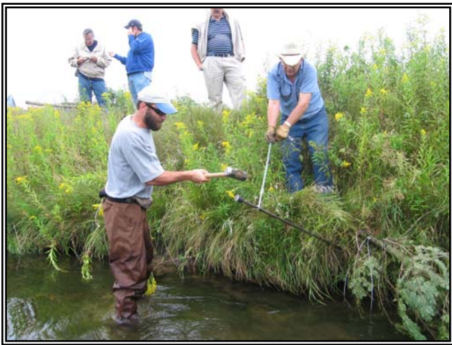
Installing large woody debris in the Pine River as part of a demonstration of river habitat restoration techniques in an August 28, 2008 workshop.